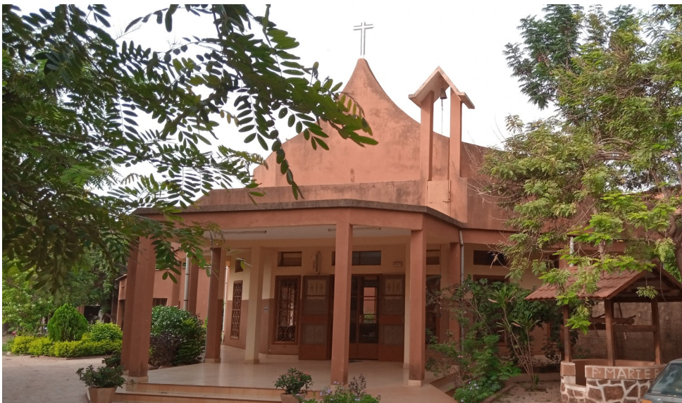
Chapel of Saint Dominic in the Vice-provincial House

“... That they may bring with them, wherever they are called, the knowledge of Jesus Christ and His mysteries...” The Rule of Sainville XXVII